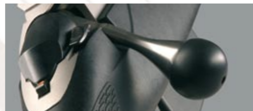
An extra large bolt handle knob. Available for all T3 rifles.

Color coded 5/6 cartridge magazines for all T3 models make the use of different loads easy to separate. Available as an accessory.